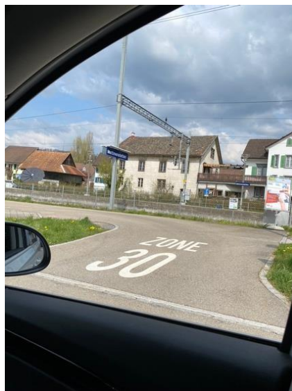
Parking Park & Ride (P & Rail)

The park & ride (park & rail) parking lot is located directly on the right after turning into the direction of Grindel 1.